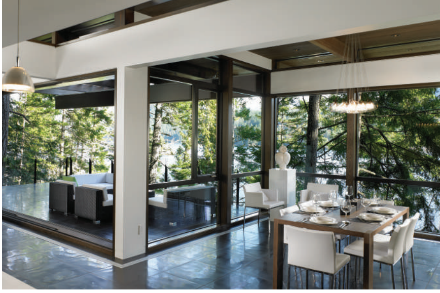
PAGE 13.