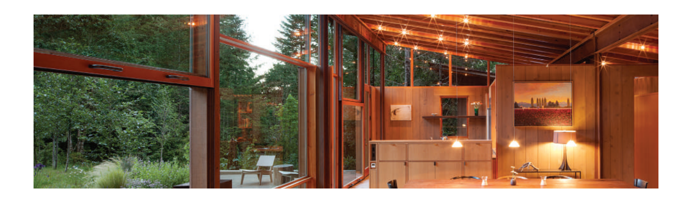
PAGE 12.

Sit down to a glass of wine and enjoy the view. Let the outside in with large sliding door panels effortlessly gliding out of the way. Choose our square interior detail and bevel bead exterior. On our casement windows you can chose a narrow stile and rail. Mull them with direct glaze picture windows to complete the look. Add a lift and slide door and your vision of expansive views will come to life.