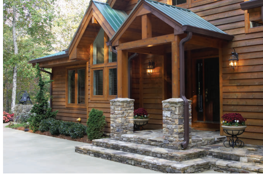
PAGE 11.