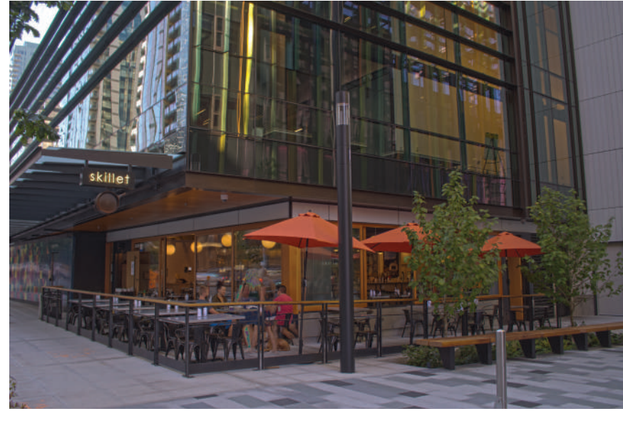
PAGE 15.