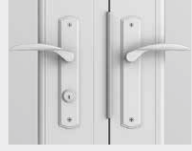
MADRONA SWING DOOR EXTERIOR HANDLE,