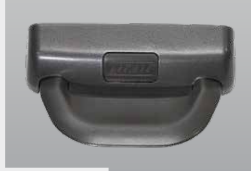
Positive Action Lock, Clay