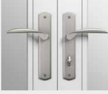
MADRONA SWING DOOR INTERIOR HANDLE, SATIN NICKEL UPGRADE