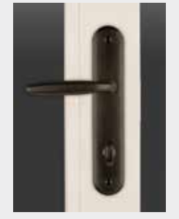
MERIDIAN INTERIOR HANDLE OIL RUBBED BRONZE