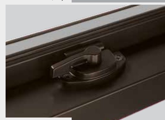
Cam Lock, Bronze