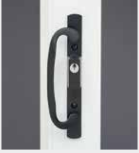
STANDARD EXTERIOR HANDLE. BLACK