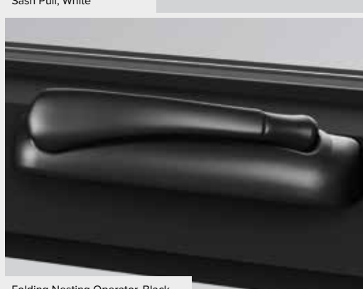
Folding Nesting Operator, Black